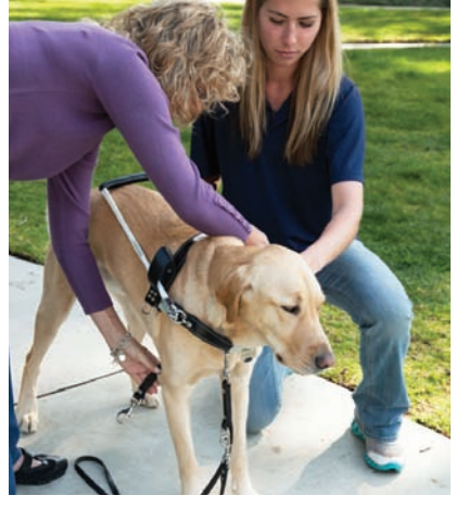
A GDA student receives instruction in how to put the harness on her new guide dog.

Students arriving at Guide Dogs of America for their 28 days of class have already made the grade. Each of them has successfully completed the extensive application and evaluation process that determines his or her readiness and ability to become a part of a working guide dog team and lays the foundation for the team's success.