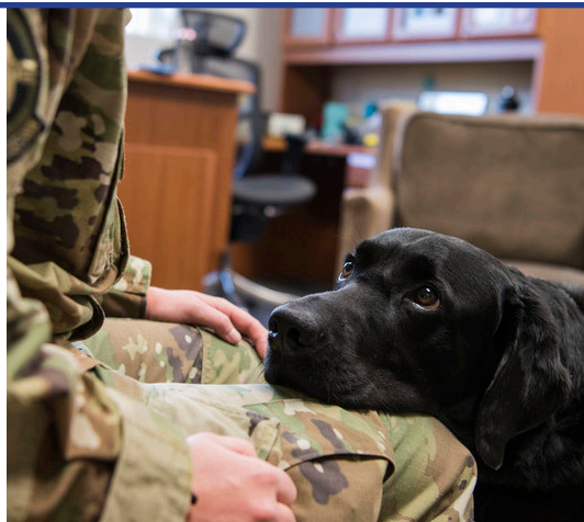
Facility Dog, Preston, with a Service Member

Thank you for bringing Ferris into her life and for all you do for the students of GDA."