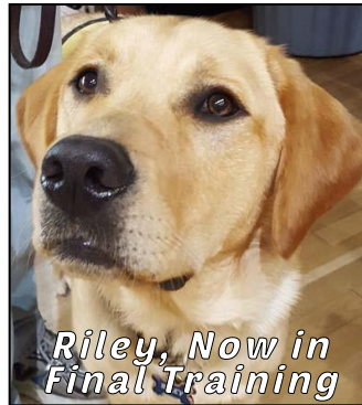
Riley, Now in Final Training