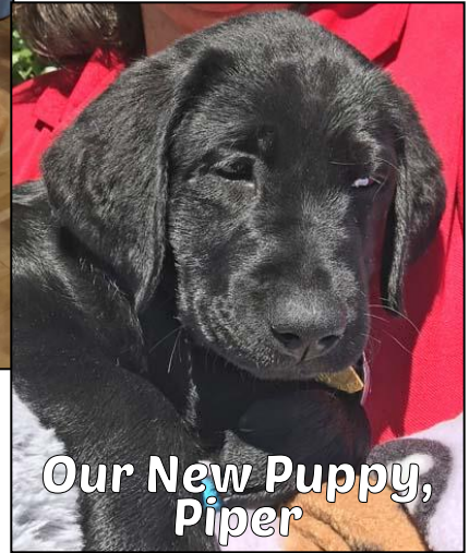
Our New Puppy, Piper

Admission: donation of $10.00 includes Hot Dogs, Desserts & "Yummies"