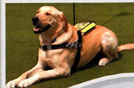
District 70 Mascot GDA Guide "ASIA"