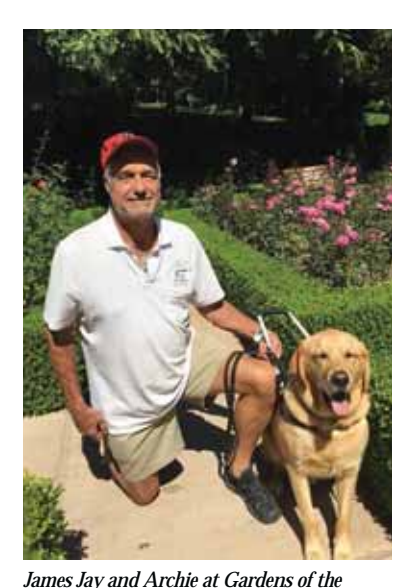
World in Thousand Oaks