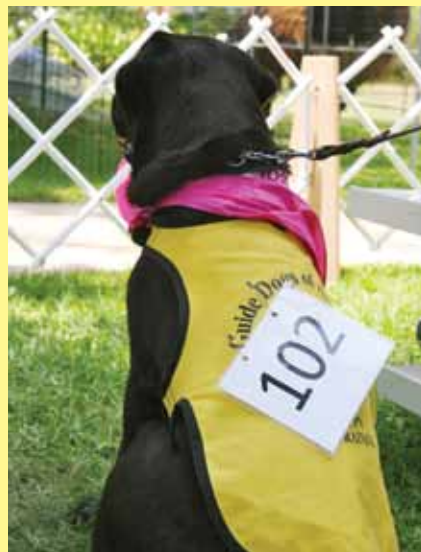
A puppy strategizes in the moments leading up to her turn in the puppy trials.