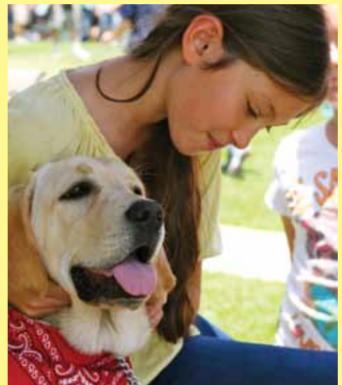
The Puppy Kissing Booth was full of business all day.