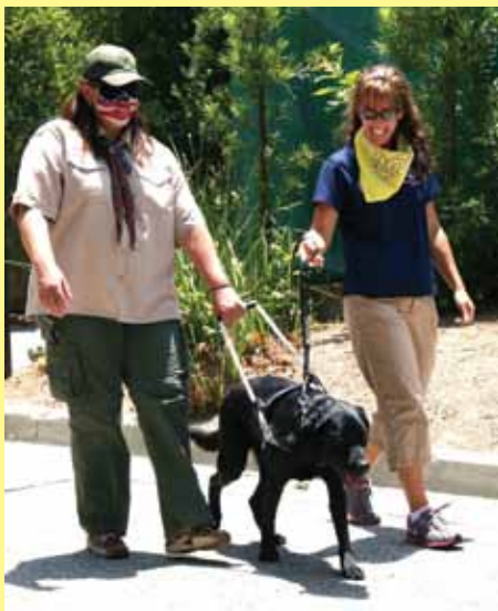
A volunteer from the audience gets a taste of being led by a trained guide dog.

It was a dog-gone good time at this year's Open House, where the theme was "Saddle Up for Western Day at GDA." Several hundred guests moseyed over to the school and joined in the festivities on Saturday, June 9. Friends old and new enjoyed the day's events, which included the always-popular Puppy Trials and Silent Auction. Here are a few photos featuring some of the highlights from the day. We hope that you'll make plans to join us next year.