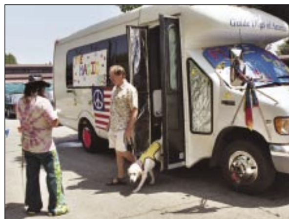
Magic Bus – The GDA van goes retro with 60s-style signs and banners.