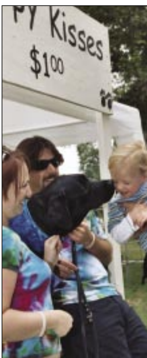
Pupper Up – This youngster takes his licks at the popular Kissing Booth.