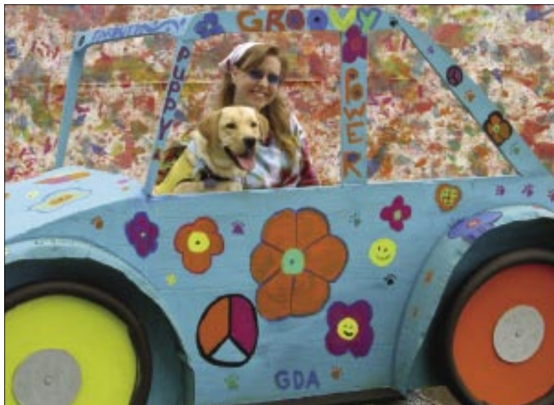
"Paw"parazzi – A Love Bug style cut-out was a photo opportunity favorite.

Almost 1,000 people were "feelin' groovy" at our Annual Open House held on June 10th, including 135 puppies-in-training sporting tie-dyed kerchiefs! Our campus took a step back into the 60's, and the scene was just perfect for newcomers, graduates, puppy raisers and sponsors to watch our Puppy Trials, enjoy great food, and make the Silent Auction our most successful ever!