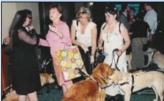
GDA graduates and their partners mingle before the First Annual GDA Alumni Reunion Dinner.

Welcome to Graduate Guide Lines, featuring news and information about GDA graduates and their dogs, who are out and about realizing their dreams of independence.