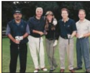
John O'Hurley of "Seinfeld" fame (2nd from left) is joined by some friends of GDA