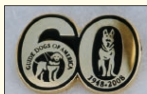
2008 GDA 60 TH ANNIVERSARY LAPEL PIN

Your purchase of the items listed here and at www.guidedogsofamerica.org/shop help to support our program. Shipping and handling is included in the price of all items featured here, excluding the "Canvas Handle Tote." See "Order Form" below for additional information.