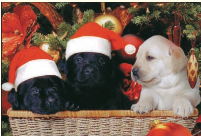
GDA HOLIDAY CARDS (Inside message: Happy Holidays)