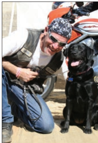
Puppy-in-training, Virtue, poses with a fan.