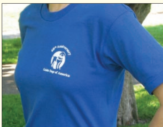
GDA 60 TH ANNIVERSARY TEE