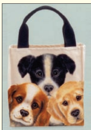
CANVAS HANDLE TOTE