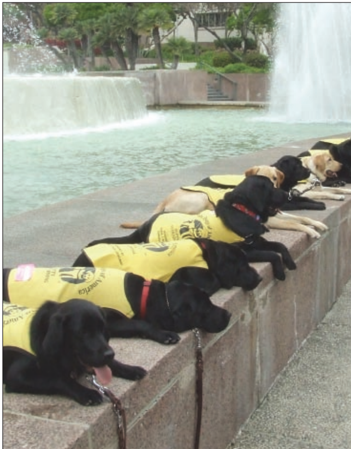
GDA puppies-in-training ready for summer fun.