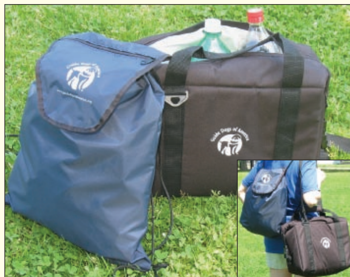
DAY PACK (left) and INSULATED ON-THE-GO TOTE (right).