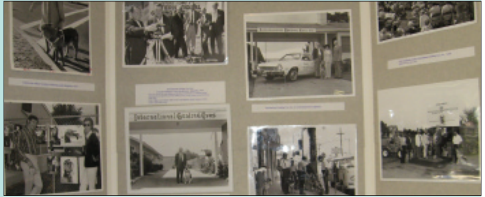
A collage of photos walked visitors through the history of GDA.