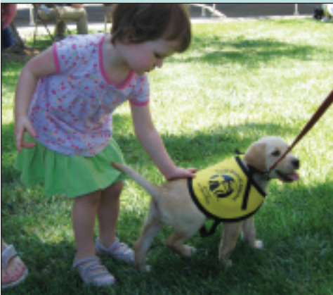
Two young "pups" enjoy their first Open House