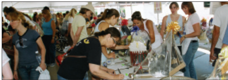
Friends of GDA show their support at the Silent Auction table at this year's Open House.

NEW GDA HOURS Effective September 1, 2008 GDA has new hours. We are open from 8:00 a.m. – 4:30 p.m. and will be closed for lunch from 12:00 p.m. – 12:30 p.m.