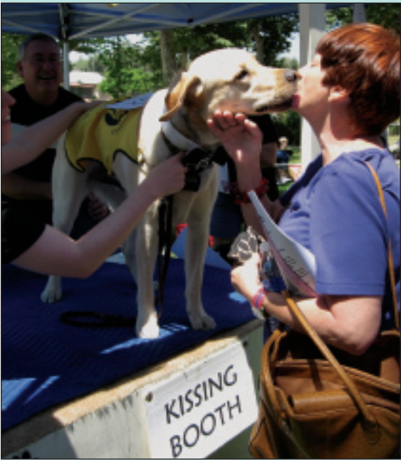
Pooches giving smooches.

This year's Annual Open House, during which GDA celebrated its 60th Anniversary, offered something for everyone...most of all fun! The photos of this page tell the story.