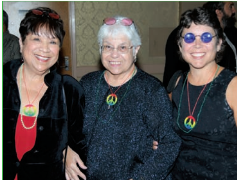
Attendees are all smiles and peace signs.

Bringing down the house on Saturday night was the 28th Annual William W. Winpisinger Charity Banquet. This year's theme was "60 Years of Rock n' Roll." There were