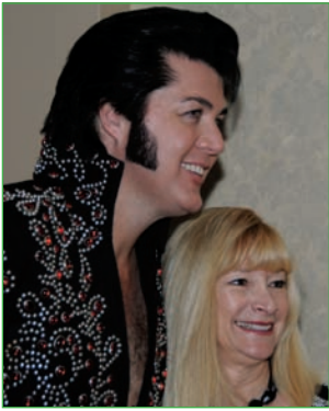
Elvis was in the building.

The good times rocked and rolled at Bally's Las Vegas Hotel when GDA celebrated its 60th anniversary during a weekend of fun and fundraising.