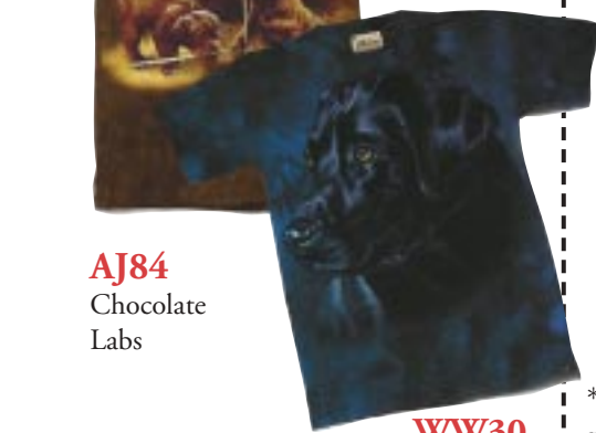
WW30 Midnight Black Lab (Adult Sizes Only)