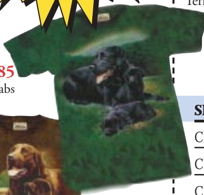
AJ85 Black Labs

100% of the proceeds go to GDA, thanks to this all-volunteer effort.