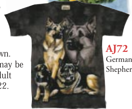
AJ72 German Shepherds

Show the world your favorite dogs, by buying one of our high-quality "favorite breed" tee-shirts. Each shirt is hand dyed and made of 100% Yellow Labs minimal-shrinkage cotton. Be sure to indicate the correct item, quantity, and size of shirt(s) desired. Shirts are available only in the color shown. Due to individual hand-dyeing, there may be slight variations in color and size. Adult sizes up to XL - $20. Sizes XXL and XXXL - $22. Children's sizes - $13. 🐾