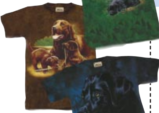
AJ84 Chocolate Labs