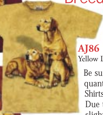
AJ86 Yellow Labs minimal-shrinkage cotton.