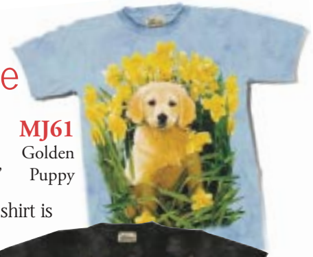
MJ61 Golden Puppy