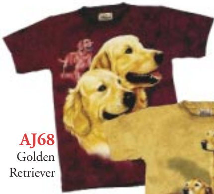
AJ68 Golden Retriever