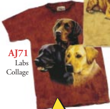
AJ71 Labs Collage