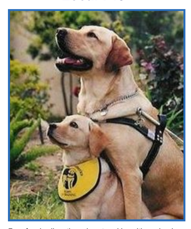
Transforming lives through partnerships with service dogs.